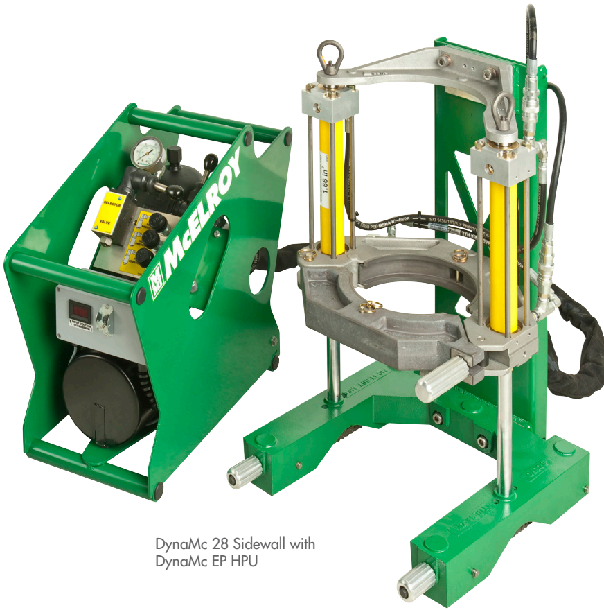
DynaMc 28 Sidewall with DynaMc EP HPU

Sidewall Fusion Capability for Branch Saddles