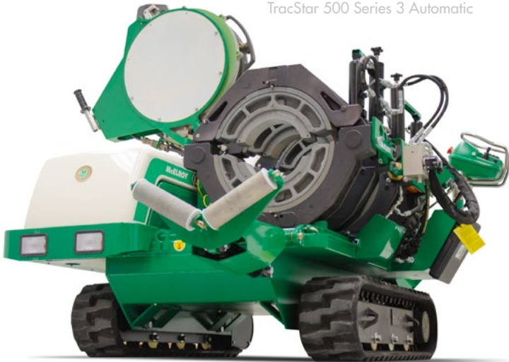
TracStar 500 Series 3 Automatic

Fusion Capability for 180mm - 500mm (6" IPS to 20" OD)